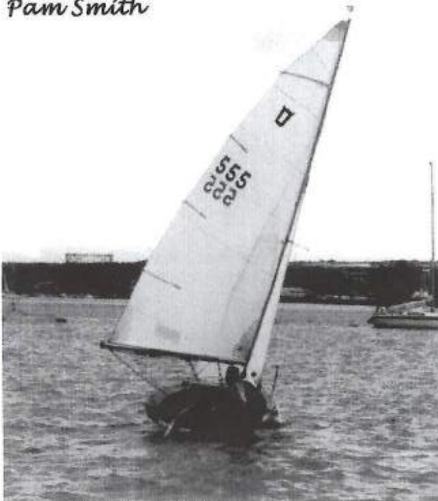
Osprey stability demo by Kift & Offer.