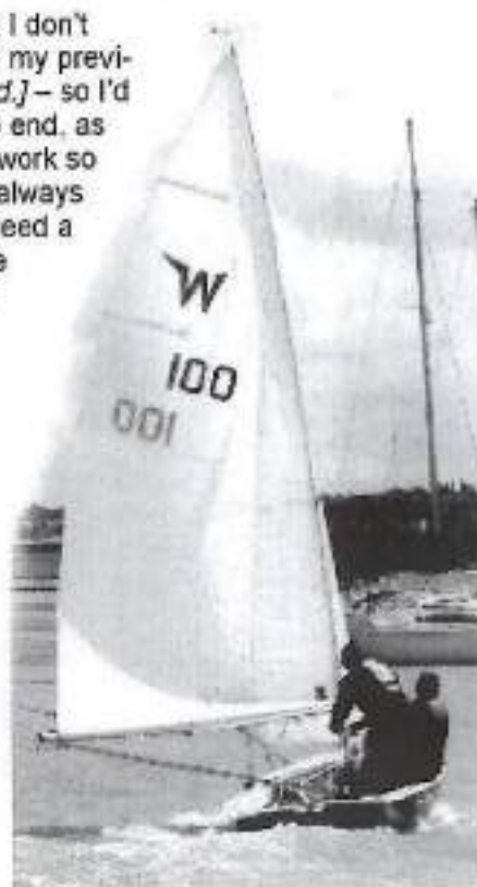
The Commodore caught in action

(the last to rig and the last to shower and I can't understand why!)